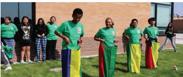
DISTRICT 518 COMMUNITY EDUCATION

Every Thursday 4 p.m.-5 p.m. NCIC Room 342