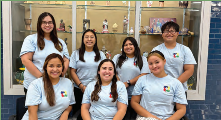
Nobles County Integration Collaborative Staff